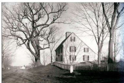
The Thomas Griswold III House

The classic saltbox dwelling was built by Thomas Griswold for his two youngest sons in 1768. The great, spreading Slippery Elm tree stood in a symbolic gateway for those entering or leaving the town. The house is one of two historic museums run by the Guilford Keeping Society.