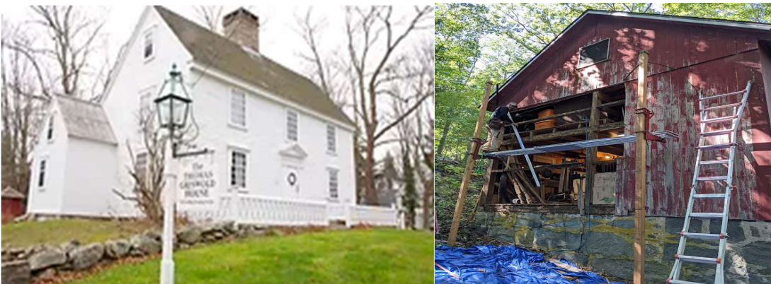
Thomas Griswold House and Barn

Once GKS received notification of the 1772 Foundation Grant award and receipt of matching donations a painter was engaged. Due to the weather and being at the end of the season's list work began very late. All prep has been completed and the bare spots at the Thomas Griswold House are being primed.