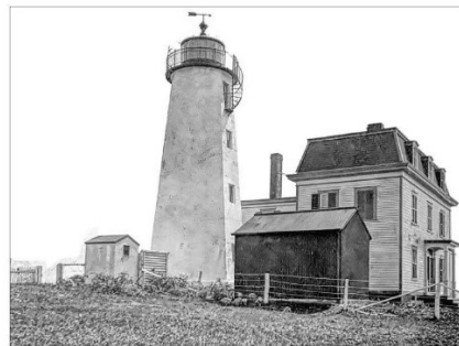
LIGHTHOUSE AND DWELLING ON FAULKNER'S ISLAND