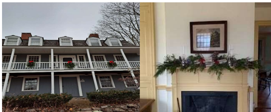
Medad Stone Tavern Exterior and Front Parlor

MISSION STATEMENT: The Guilford Keeping Society collects, preserves and shares the history and heritage of Guilford, Connecticut for present and future generations