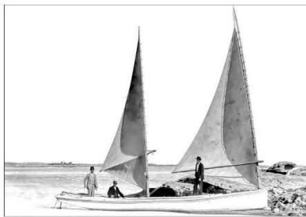
A DOUBLE-MASTED NEW HAVEN SHOOP

The classic saltbox dwelling was built by Thomas Griswold for his two youngest sons in 1768. The great, spreading Slippery Elm tree stood in a symbolic gateway for those entering or leaving the town. The house is one of two historic museums run by the Guilford Keeping Society. Photo: Oliver Husted, 1900