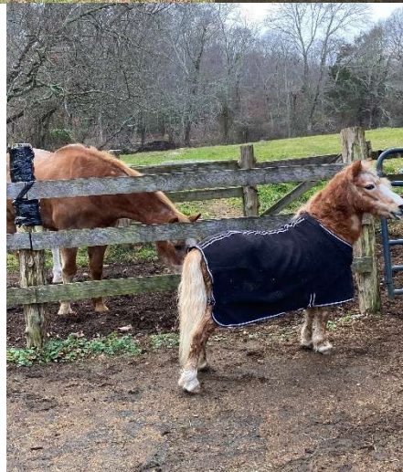
Trinket and Frosty